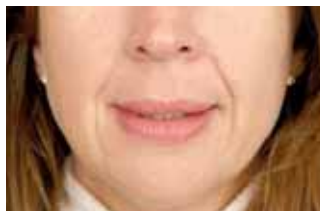
Nasolabial fold correction with Juvéderm® ULTRA 3