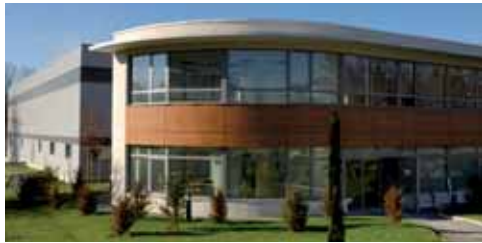
Juvéderm® ULTRA manufacturing facility in France

Patient satisfaction is at the heart of our research and development. We have the treatments, devices and professional support to help practitioners offer patients the natural look they want.